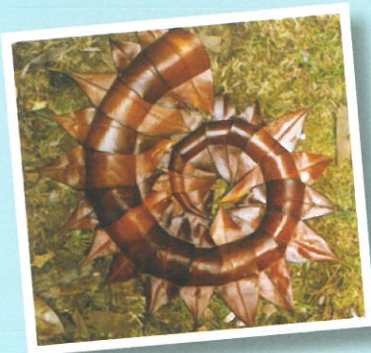
Leaves polished and greased, pinned to the ground with thorns.

Why don't you try making one next time you visit the coast?