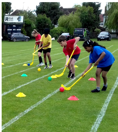
Year 3 enjoy their stick and ball race.