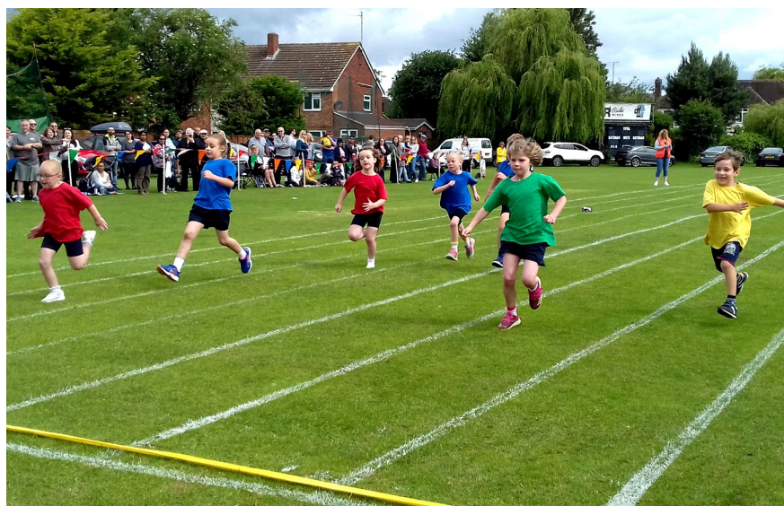
A very close Year 2 sprint!